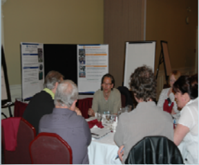
Elected officials discussing agriculture at the EOF