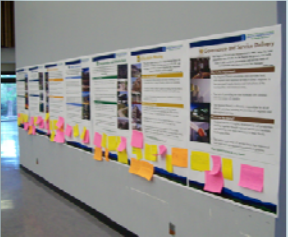
A wall full of comments: Vernon Open House